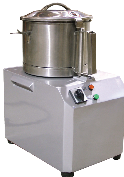
3.2-Quart / 3-Liter